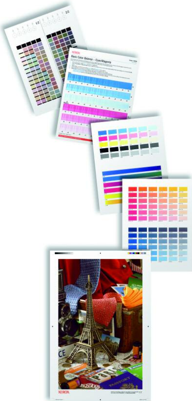
Built in colour calibration tools give you the final output you want.