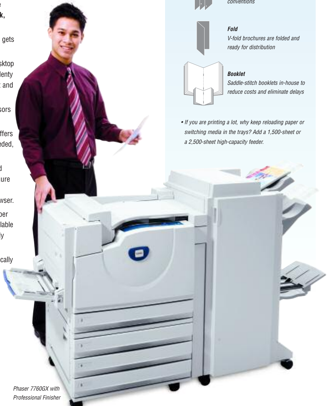
Phaser 7760GX with Professional Finisher